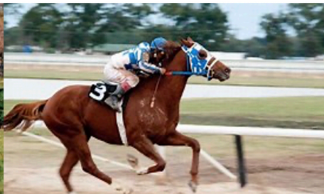
Secretariat with Ron Turcotte Aboard