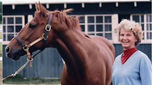
Secretariat with owner Penny Chenery